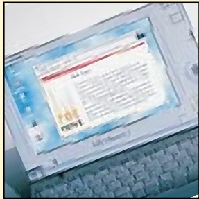
The big screen: So you're always fully in the picture, the Libretto 100CT has a 7.1" TFT colour screen with 16.7 million colours.