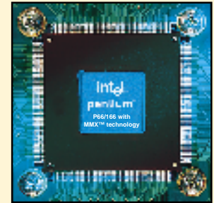
Small footprint, big heart: The Libretto 100CT has a high performance 166 MHz Pentium® Processor with MMX™ technology.