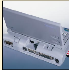
Expansion is in the detail: The Mini Card Station handles large data tasks and gives rapid links to peripherals. It also offers an extra PC card slot.