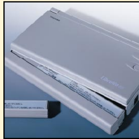
Just like the grown-ups: the Libretto 100CT has slots for two PC Cards Type II or one Type III. A high-capacity battery lasts for up to 5 hours of mains free operation.